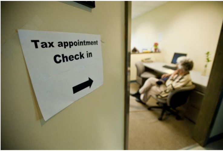
A Jackson resident waits to receive help from volunteers with the Community Action Agency's Volunteer Income Tax Assistance program at the Ayieko Resource Center, 410 E. High Street in Jackson, Thursday, June 20.