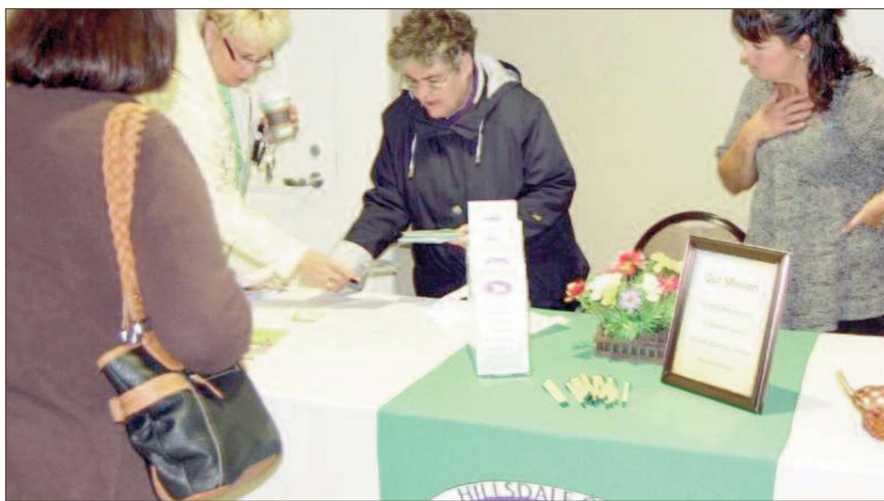
The Hillsdale County Coalition offers information at programs on Youth Suicide Awareness.