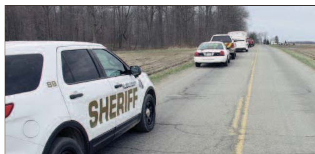
Hillsdale County Sheriff vehicles lined Dimmers Road Sunday afternoon just west of Gilmore Road. [FILE PHOTO]